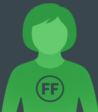
Clara Your Claims Agent

McKinsey & Company The Future of AI in the Insurance Industry