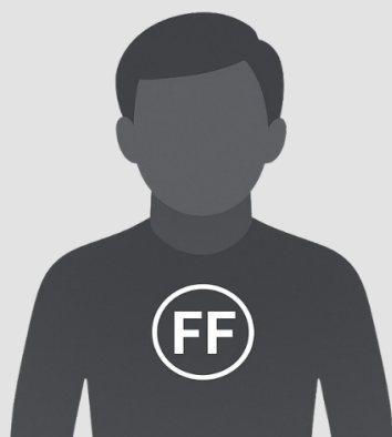
Porter Your Policy Agent

“Insurers that embed generative AI tools into their quoting process can double their submission to quote rate and reduce premium leakage. ”