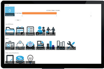
Figure 1: HR Trial Environment

The FlowForma HR offering is a packaged solution containing many common HR processes, pre-built and ready to go. The homepage on the HR site contains tiles (buttons) that enable the end user to quickly launch new processes and view in-progress processes. Figure 1 illustrates the concept of our single point of access to all HR activity. From the homepage you can easily launch new processes. Figure 2 shows the Leave Request process, which allows employees to request leave, keeping track of their leave balances and ensuring that all leave requests are passed through the correct level of approval.